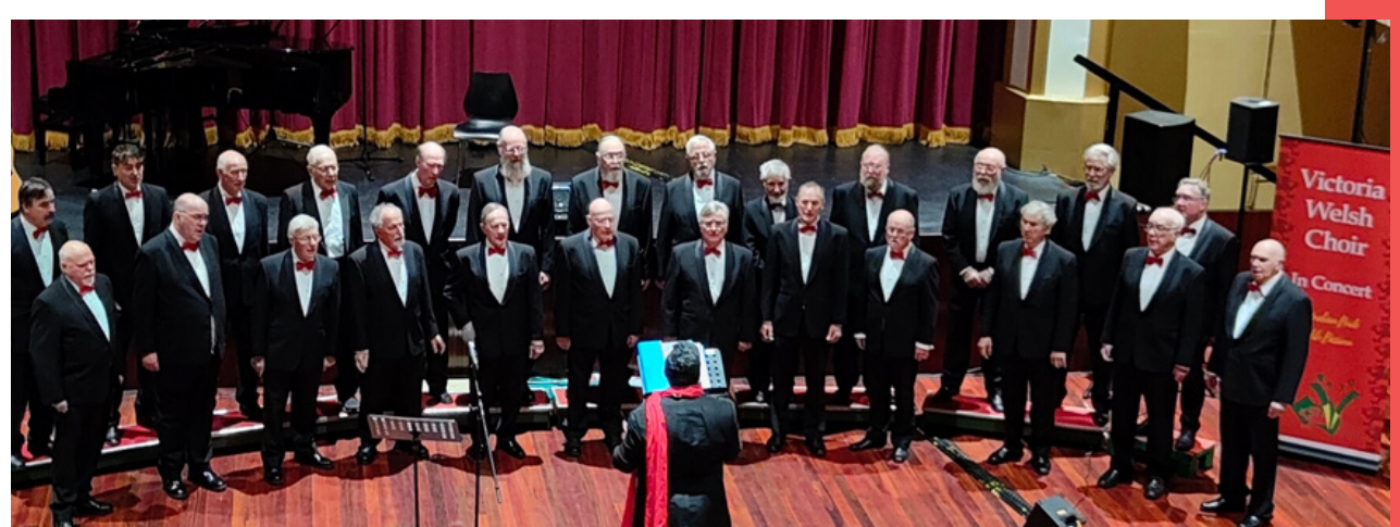
Regent Theatre Yarram.